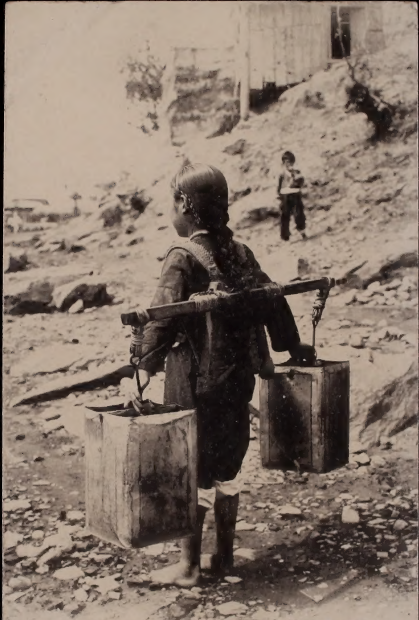
(1421) A BOY OF WATER DRAWER 汲水ノ供子 (俗風鮮朝)